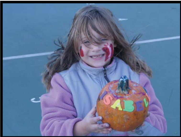
Just ask Isabella; it's all about the smiles at the Coleman Country Fall Harvest Festival!