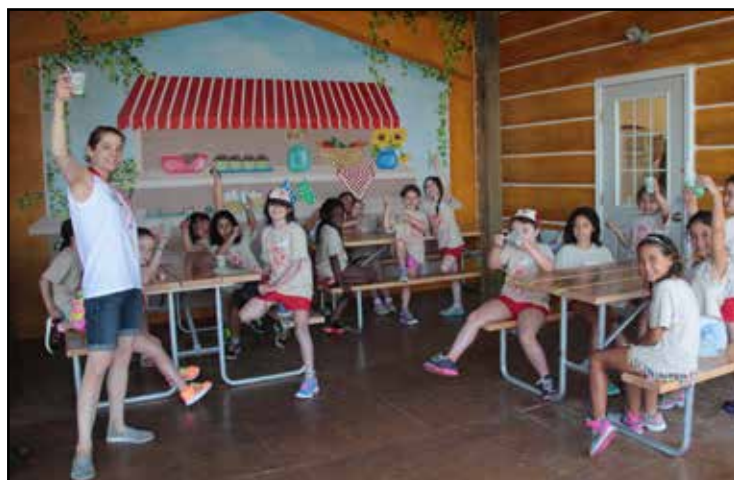
LOOK WHAT'S COOKING...The Massapequas whipped up some goodies in the new indoor/outdoor cooking "gourmet kitchen"!

The BINGO fun will kick-off at 7 p.m., followed by Despicable Me 2 at dusk!