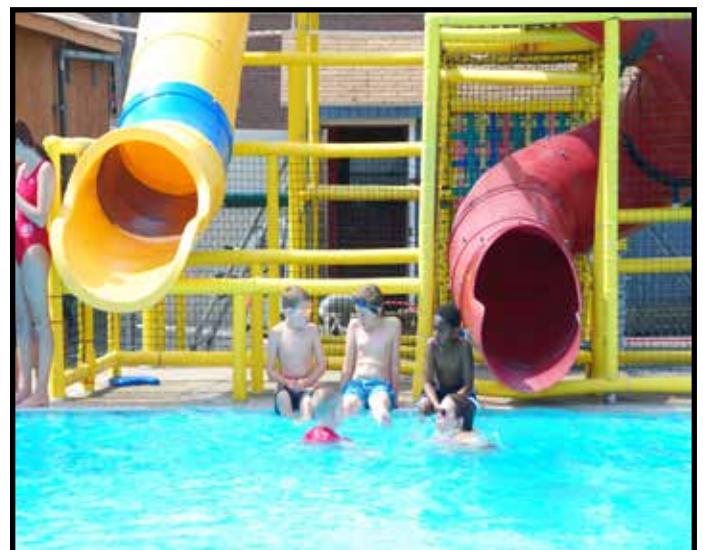
SLIDING INTO SUMMER FUN...The B-4 boys tested the waters on the newest pool addition during our glorious first sunny summer day!