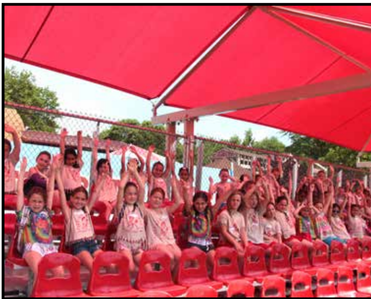
LET'S HEAR IT FOR THE SHADE...The G-3 girls enjoyed fun in and out of the sun in the coolest new venue on The Ranch!

If you would like to contact your child's Supervisor anytime during the summer, please call our main office at 516-620-4300, or email us at mailbox@ColemanCountry.com .